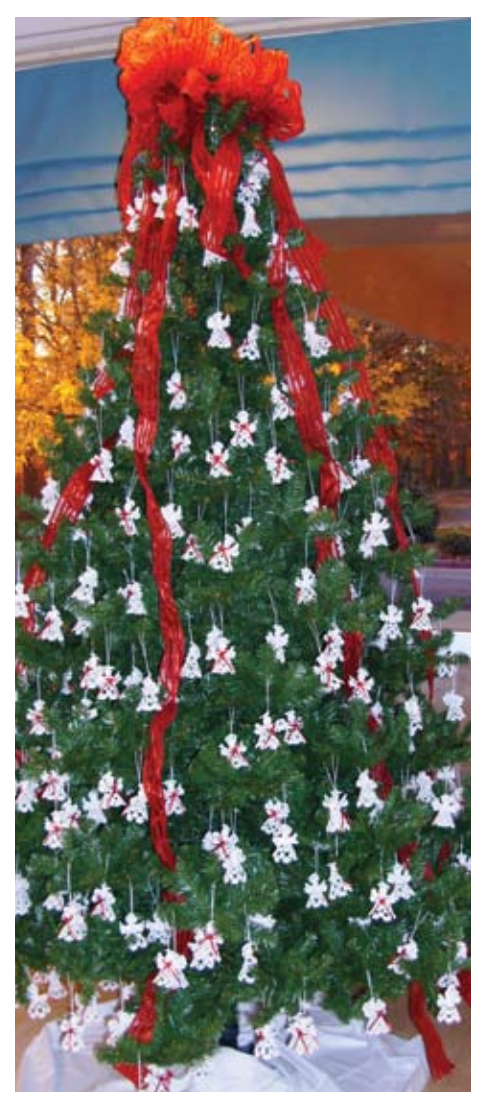
The Angel Tree allows donors to honor or remember a special someone with an ornamental angel on the Medical Center's Christmas tree.

We are most proud of the donations of employees of the Medical Center. This year, they gave $52,000, an increase of $18,000 over last year. "It is quite