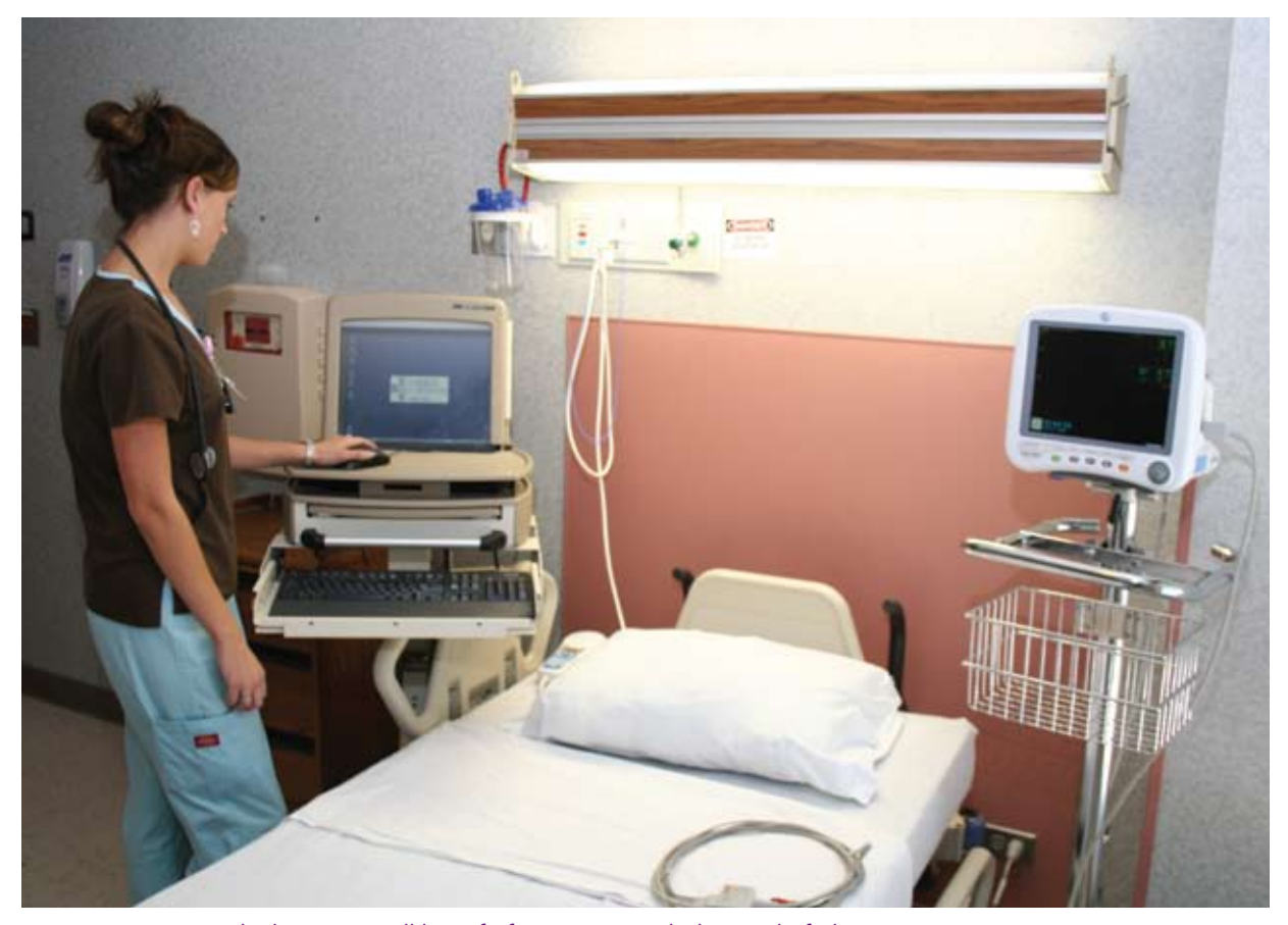
Patients arriving with chest pain will benefit from an extended period of observation.